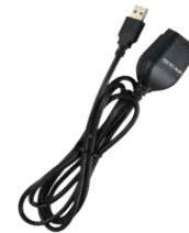
Data Transmission Cable